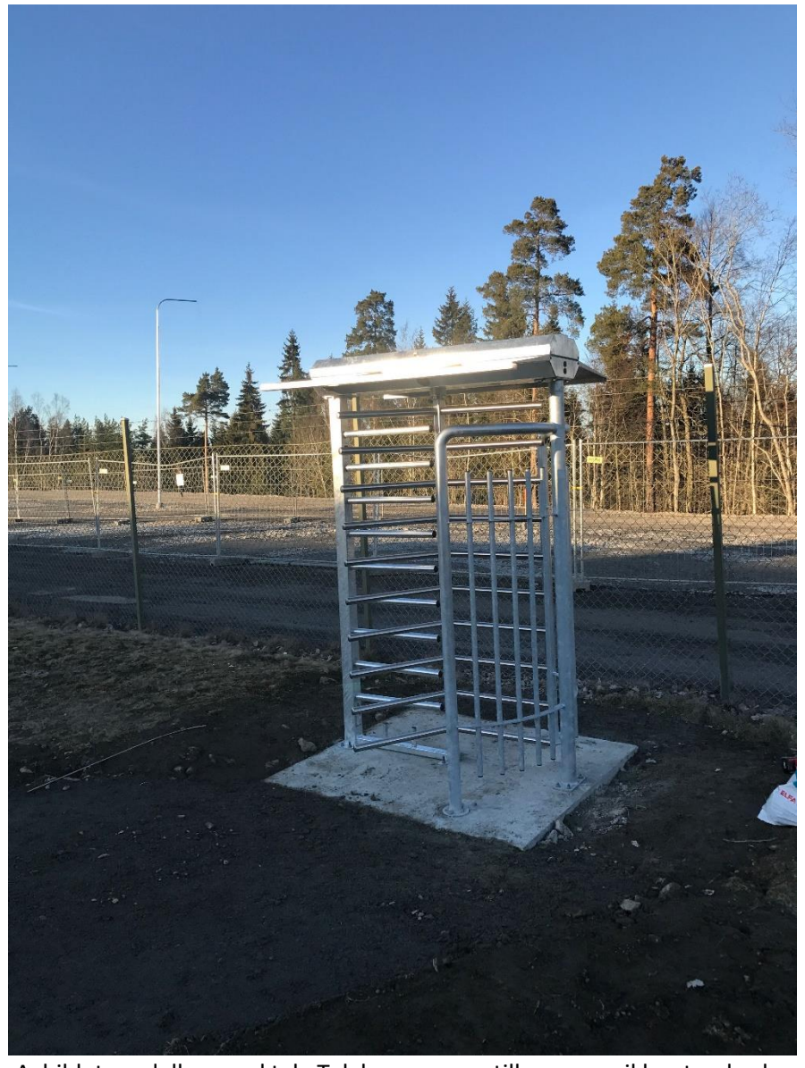
Avbildet modell er med tak. Tak leveres som tillegg og er ikke standard.